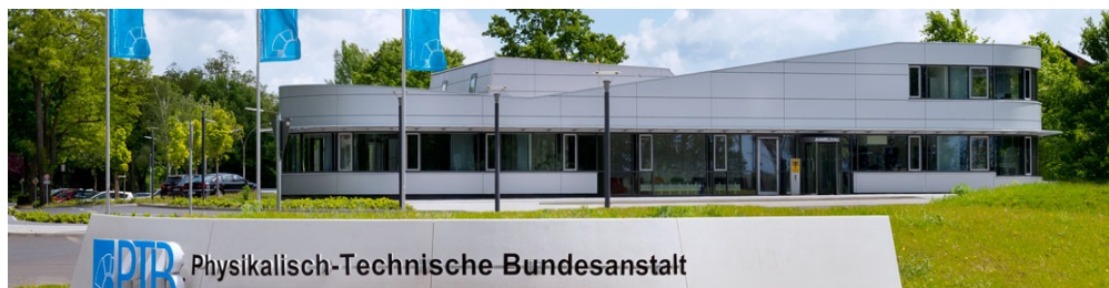
PTB Physikalisch-Technische Bundesanstalt